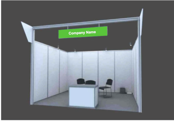
Design 1: 50/m 2

* The package includes 1 KW power supply per 12 m 2 .