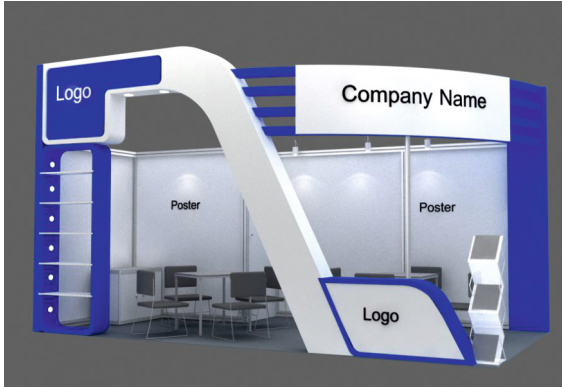
Design 4: 170/m 2