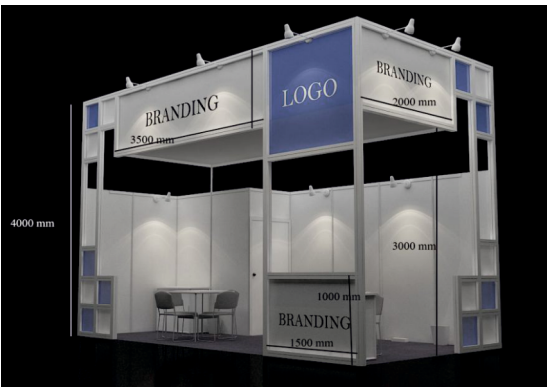
Design 3: 105/m 2

* The package includes 2 KW power supply per 12 m 2 .